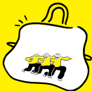
日安小袋 LUNCH BAG